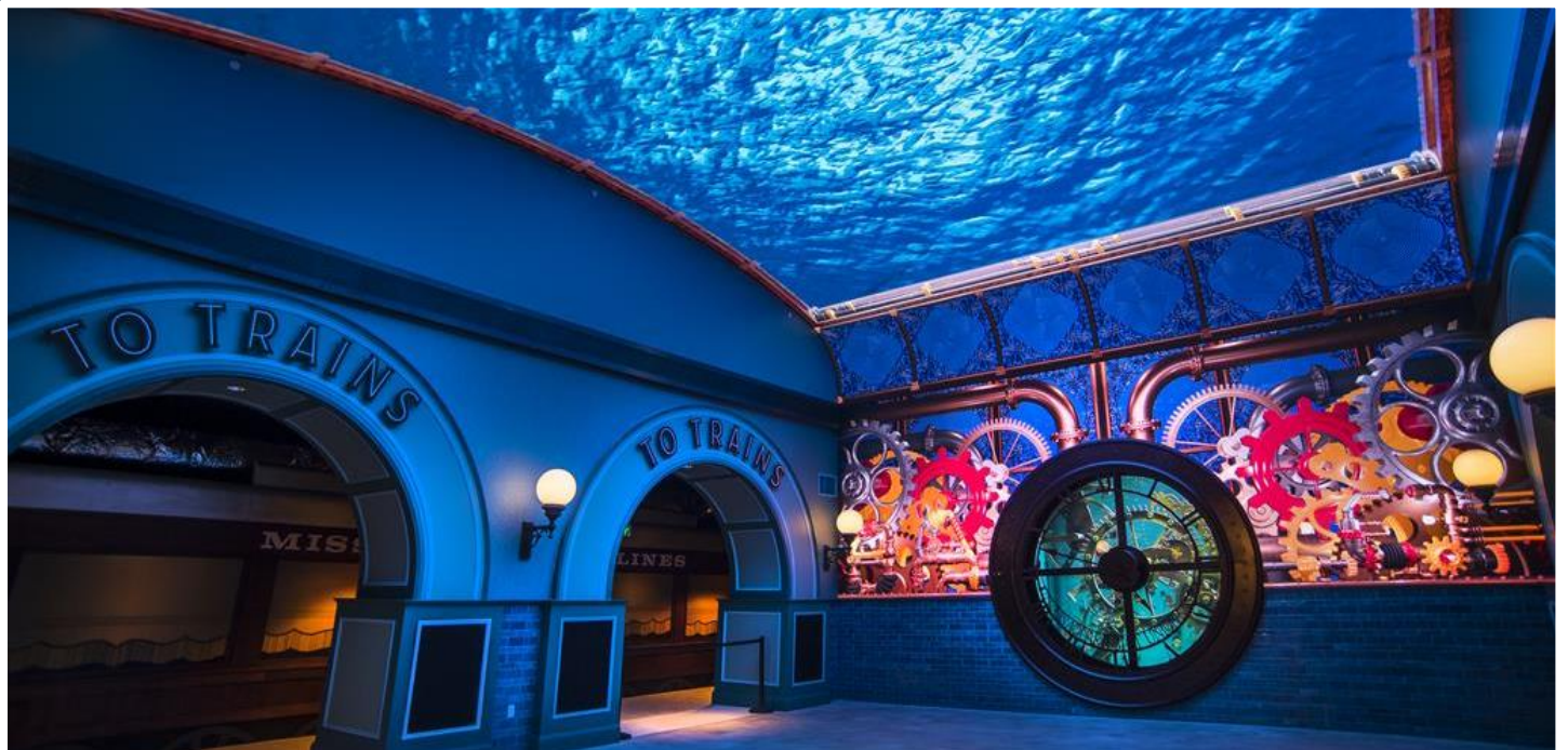
Picturall Pro media server drives award-winning entrance experience at new St. Louis aquarium (USA)