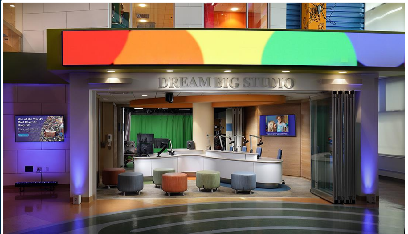
Picturall Quad media server drives LED video display at Hospitalized Children's Hospital's Media Production Facility (USA)