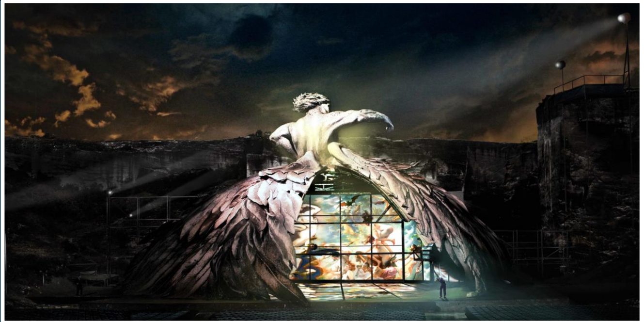
Picturall quad-output media servers drive a 340 m 2 LED wall for Puccini's Tosca in a Roman quarry in St Margarethen (Austria)