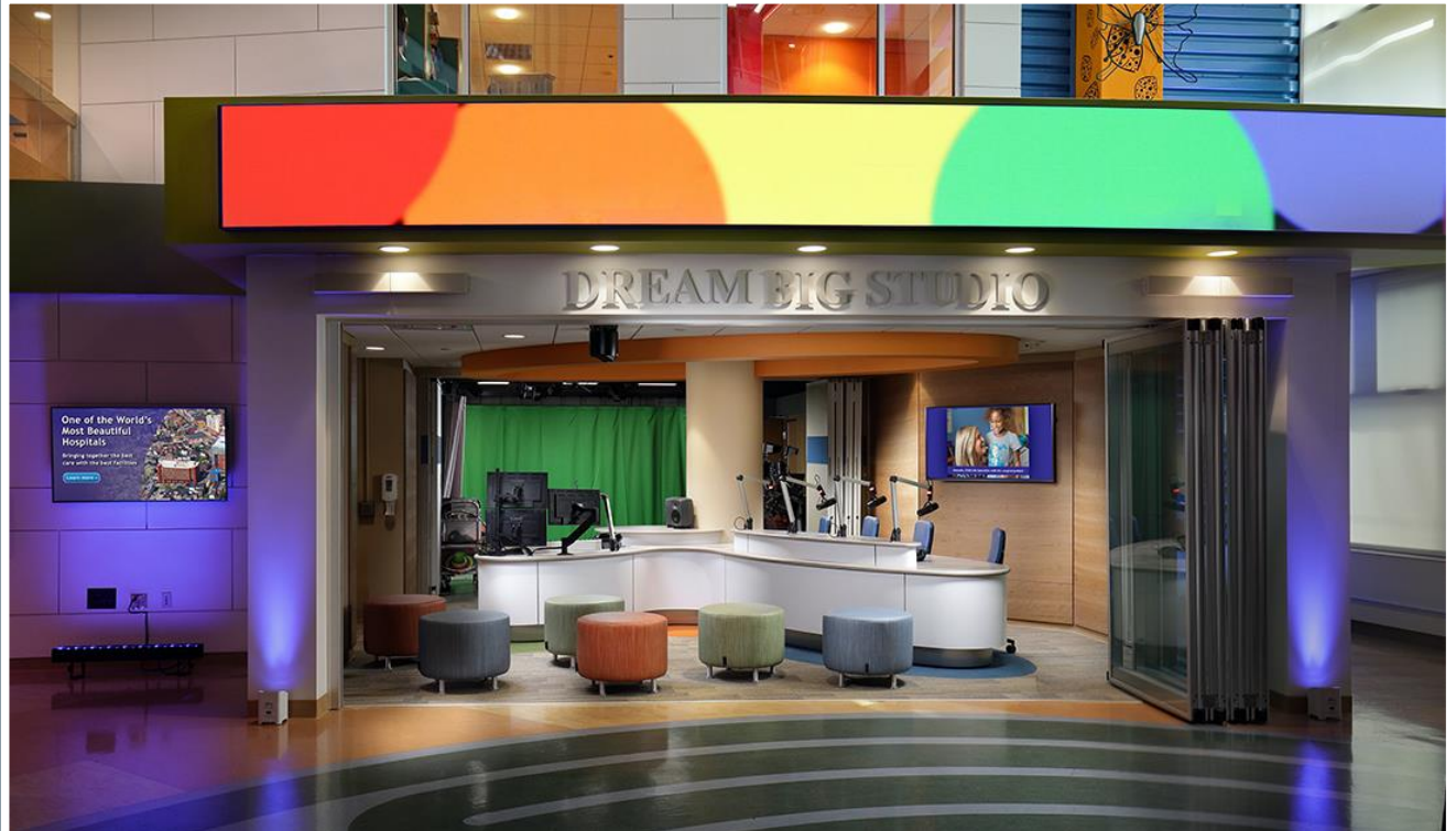
Picturall Quad media server drives LED video display at Hospitalized Children's Hospital's Media Production Facility (USA)